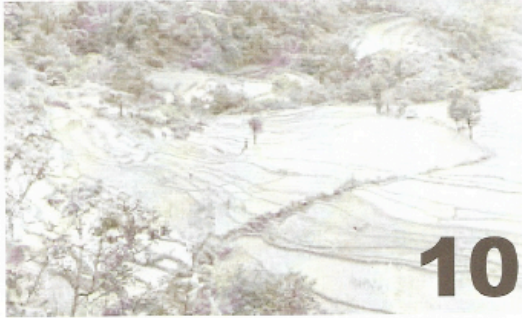
Water and Climate Induced Vulnerability in North-east India: Concerns for Environmental Security and Sustainability