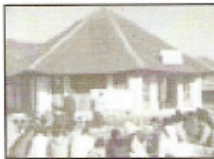
Mobilization of Human Resources for Sustainable Development: The Future Generations Arunachal Initiative