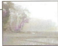
Bamboo: Sustaining its Growth & Productivity to enhance livelihood, ecological and food security in Tripura