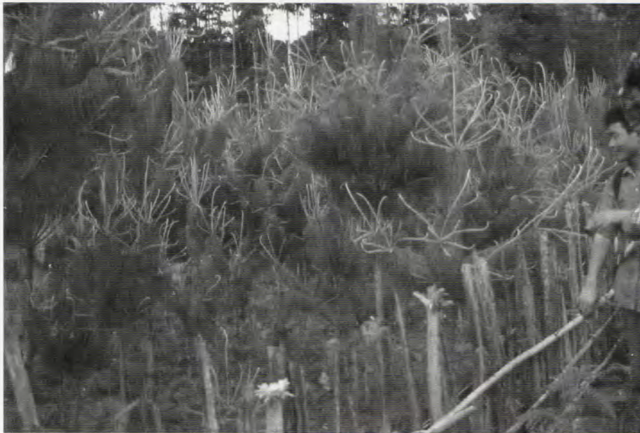
Figure 5. Late-rotation plantation

Takhe Gumbo owns four plantations, the largest of which