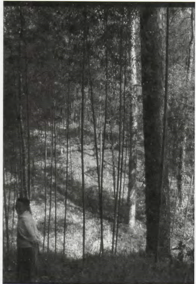
Figure 4. Private plot

The Tatu family manages a 1.0 ha plantation not far from their house in Siro. In the winter of 1999 the plantation was mapped and the resources surveyed. The plantation was established in