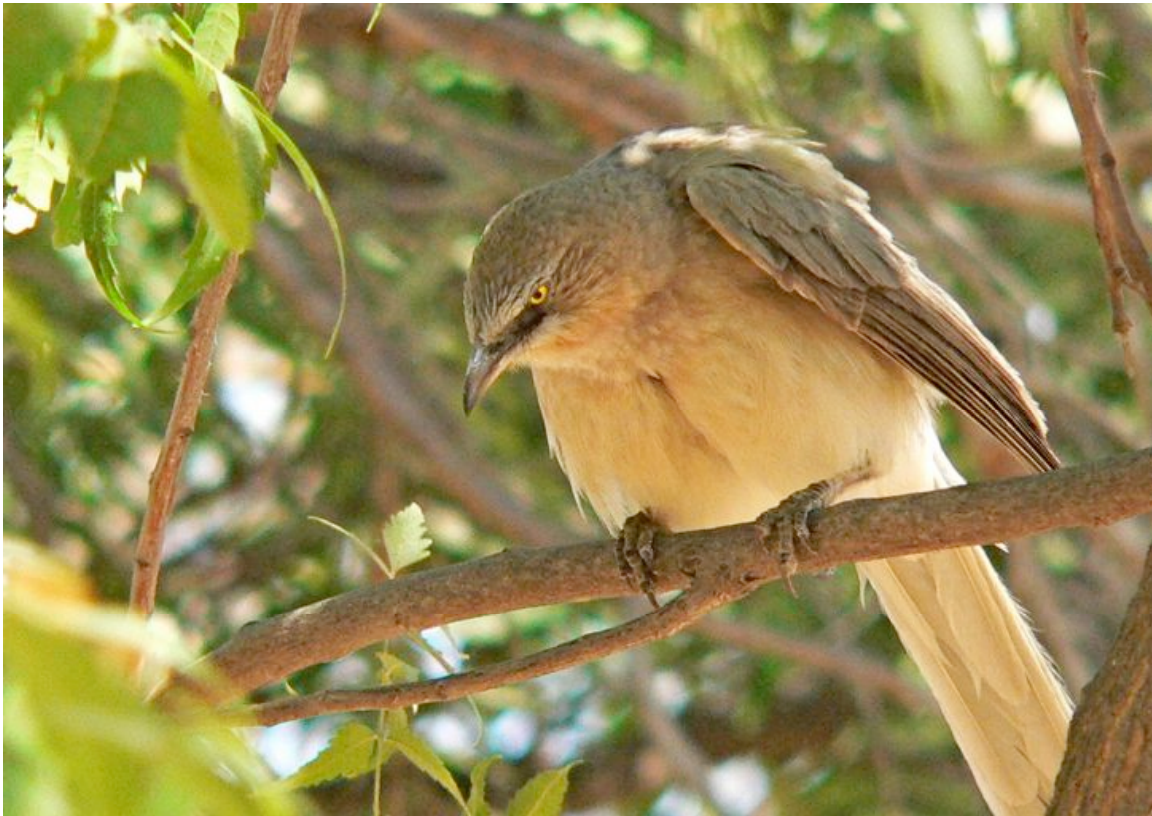
A Large Gray Babbler, Turdoides malcolmi , in a Prosopis cineraria tree in the Khejarli Grove.

On a peaceful February morning, five wild Nilgai, India's largest antelope, browsed placidly inside the red sandstone fence of the Khejarli (Khejadli) Grove while Large Gray Babblers, their low contact notes holding the flock together, searched for termites in the shade of nearby Prosopis cineraria , khejri trees. And all the while, a caretaker, a man with a white turban and a splendid black moustache, explained the history and significance of this sacred shrine.