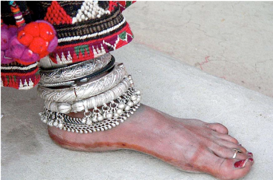
Anklets are a common feature in much of India, including among the Bishnoi.

Buddhism and Jainism. In addition to protecting large plants and mammals, Bishnoi are admonished to strain water and other liquids through a fine cloth prior to drinking; this prevents accidental ingestion. Another tenant recommends that dung cakes or logs be shaken before being added to a fire as this helps remove beetles and other creatures.