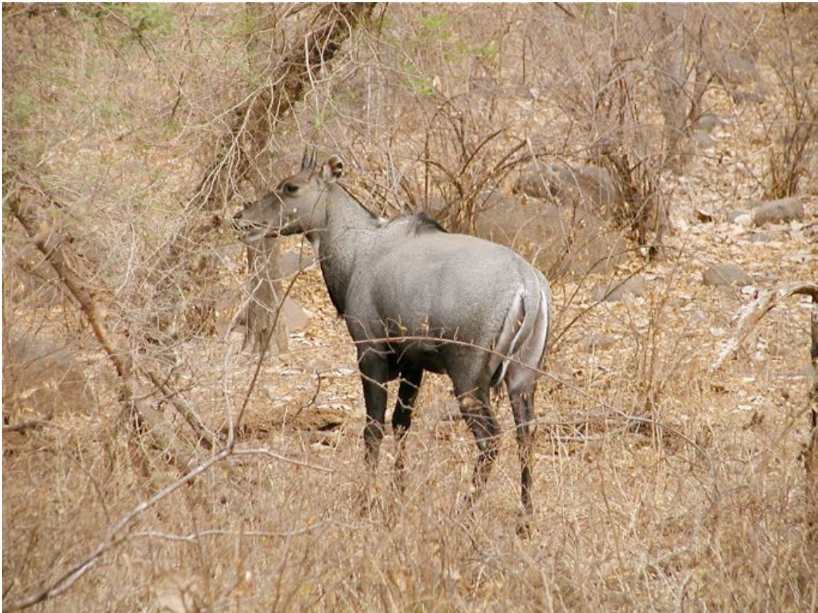
A male Nilgai in the Ranthambore Nat Park, Rajasthan in dry April conditions.

The Nilgai, Boselaphus tragocamelus , one of the other two low-elevation antelope of India also benefit from Bishnoi precepts. This large antelope, considered one of the remnants of a group of hoofed animals that possibly gave rise to domestic cattle [see Menon p. 46], sometimes parades through Bishnoi territory as if on show. The largest males range up to 250kg/550lbs, the size of a small horse, and this places