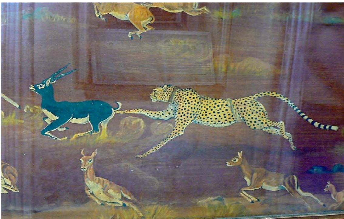
A painting of a royal hunt on the Deccan Plateau

These antelope, while among of the fastest mammals on earth, were still a favorite target of the Asian Cheetah ( Acinonyx jubatus ), a cat which used both surprise and a blinding, short-distance dash that could reach 110kph/70mph to catch them. A form of entertainment among Asian elite of the past was to hunt with cheetahs. The great