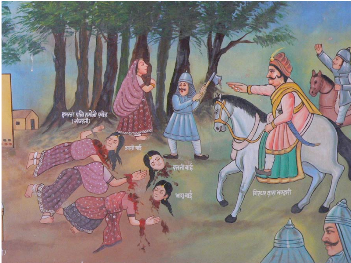
The 1770 slaughter at the Khejarli Grove complete with names of some martyrs.

some 360 people including women and men, both young and old, were cut to pieces as they hugged trees and otherwise threw themselves in front of the armed force. Shortly after the incident, the Maharaja learning of the massacre, issued an apology and decreed that henceforth there would be no tree-cutting or animal hunting in Bishnoi territory. For nearly 300 years, now, the Khejarli Grove has remained a peaceful shrine dedicated to the bravery of the Bishnoi.