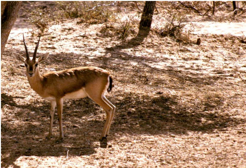
A male Chinkara near Jodhpur.