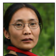
Tsering Digi Tibet, China "Sustainable Development"