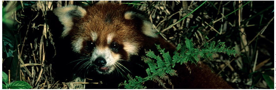
The Red Panda is among the many rare species protected through community conservation efforts in the subtropical forests of Arunachal Pradesh.

www.future.org Blog: fgarunachal.blogspot.com