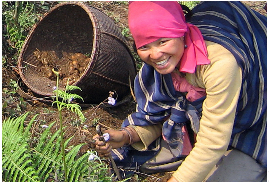
More than 90 women's groups are improving nutrition and increasing family income through kitchen gardens and micro-credit programs.

Women's groups mobilize communities, improve health and sanitation, and create sustainable local economies. They inspire groups, such as farmers and youth clubs, to join the process.