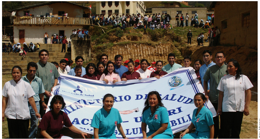
The Umari Primary Health Center is one of five model health centers in Huánuco and Cusco that function as self-sustaining regional training centers to improve health practice and outcomes.

Calle Las Petunias 110, Ofc. 302 Camacho, La Molina Lima 12 Peru Tel. +511-436-9619 peru@future.org www.future.org