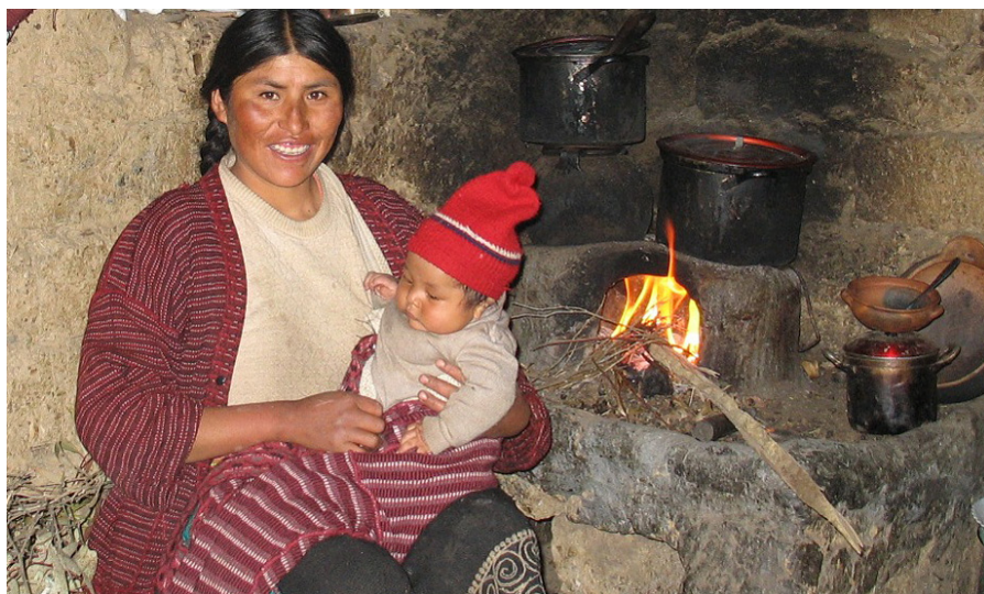
Future Generations Peru has helped to reduce chronic child malnutrition in Las Moras (Huánuco) by 28% and across more than 250 communities in Cusco by 9%.