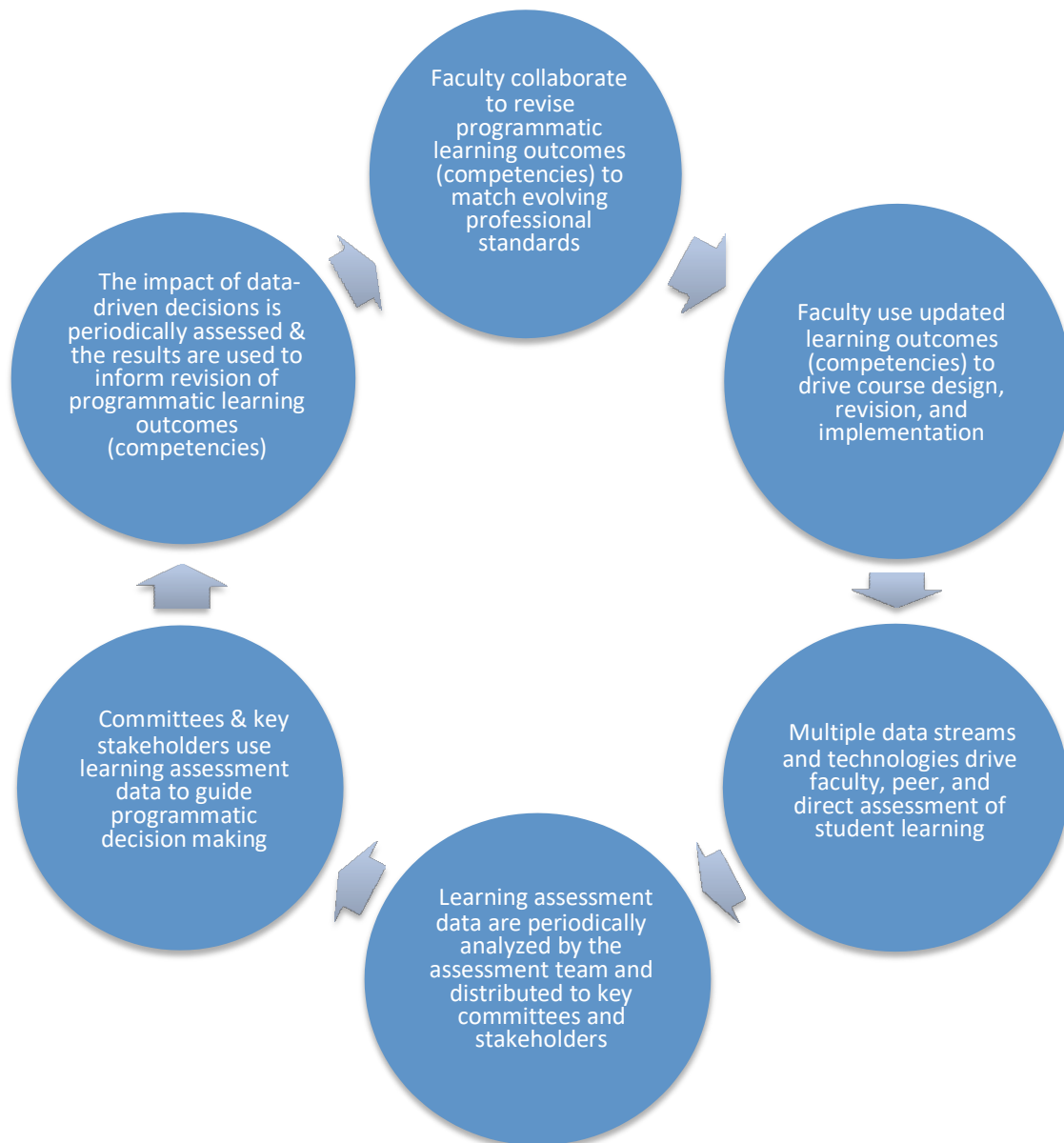
Figure 2: Learning Outcomes Assessment Cycle